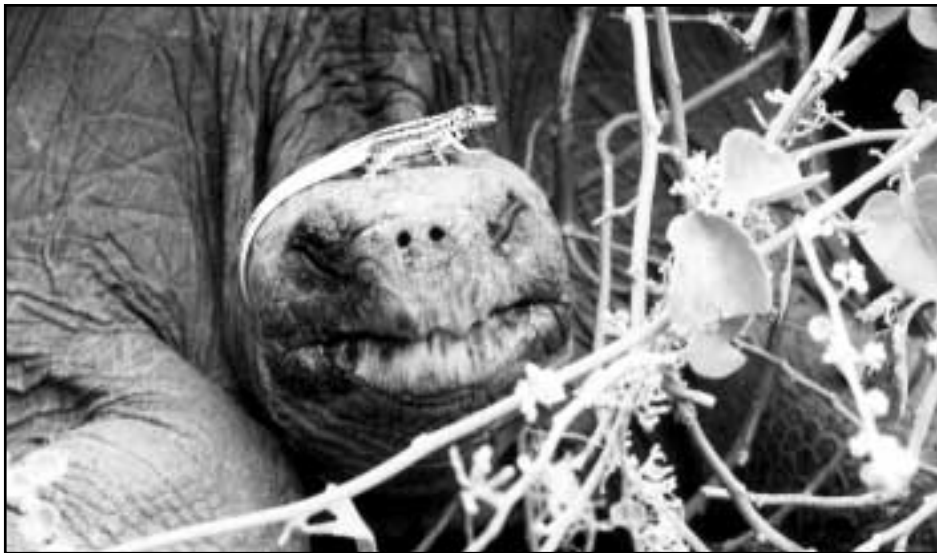
Two friends hanging out on the Galapagos Islands, Ecuador