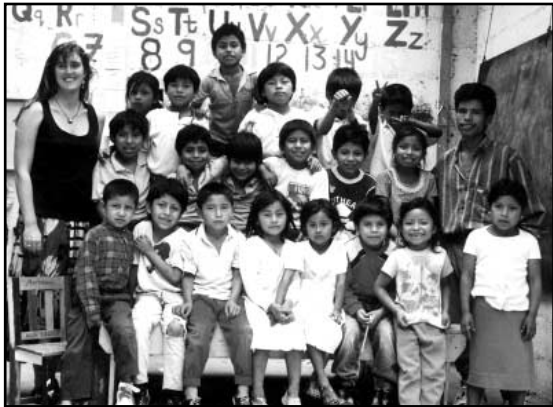
Volunteer project in Panajachel, Guatemala

Over the last several years, AmeriSpan has increasingly received requests from people looking for volunteer work or internships in Latin America. It is nearly impossible to find “quality” volunteer work or a good internship in