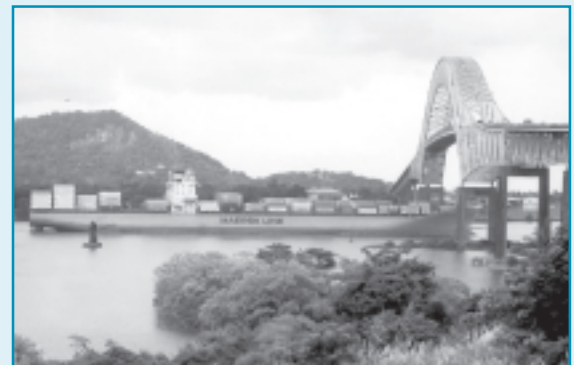
The Panamá Canal

The Panama Country Close-up is as of March 1999 and provided by The Latin American Travel Advisors. For additional details, PO Box 17-17-908, Quito, Ecuador. USA & Canada toll-free fax: (888)215-9511. International Fax: +593-2-562-566. Email: lata@ecnet.ec Web: www.amerispan.com/lata/