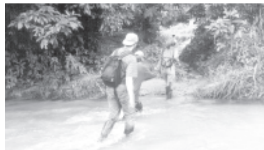
A jungle walk in Bolivia

small town feel. The area reflects the diversity and contrast of its country. Colonial villages, traditional communities and pre-Colombian archeological sites are within reach.