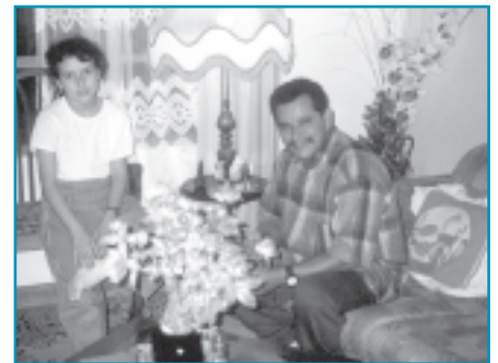
A homestay in Monteverde

The program offers an additional campus in San Joaquín, a suburb of San José, Costa Rica's capital. If you wish, you can switch to this campus after completing at least one week in Monteverde.