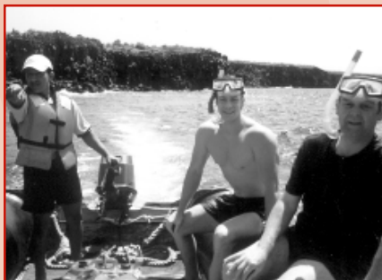
Vacationing on the Mexican coast.

Political Situation: Stable. Constitutional Democracy. President Ernesto Zedillo (term 12/94 to 11/2000). Intensive political maneuvering is underway in anticipation of next year's presidential elections. The incumbent Partido Revolucionario Institucional (PRI) , will hold primary elections on Nov 7. The two front-runners for the candidacy are Roberto Madraza, the controversial governor of the state of Tabasco, and Francisco Labastida Ochoa, an ex-cabinet minister. After 70 continuous years in power, the PRI is still considered unassailable, unless the two main opposition parties can form a united front against it. This alliance has been illusive however, as neither Vicente Fox, leader of the right-ist Partido de Acción Nacional (PAN) nor Cuauhtémoc Cárdenas of the centre-left Partido Revolucionado Democrático (PRD) seem eager to give up their own presidential candidacy in favor of the other. Five months of protest by students of the large state university UNAM , continue in Mexico City. The politically-inspired unrest which was sparked by an increased in tuitions, has divided the student body and sporadically degenerated into violence.