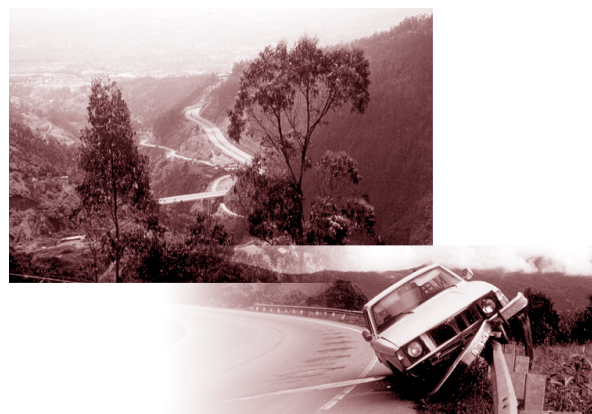
Novel parking protocols in the Andes.

Though you will often curse the driver's apparent disregard for your well-being, you'll also have occasion to sing his praises. For when the bus breaks down (as it invariably does), he can display his breathtaking mechanical genius. More often than not, this will happen in the middle of the night, far from the nearest dwelling, with the