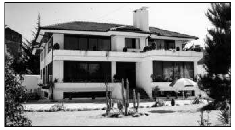
Academia Latinoamericana de Español, one of AmeriSpan's partner schools in Quito, Ecuador.

Language Travel Contest — Everybody Wins!