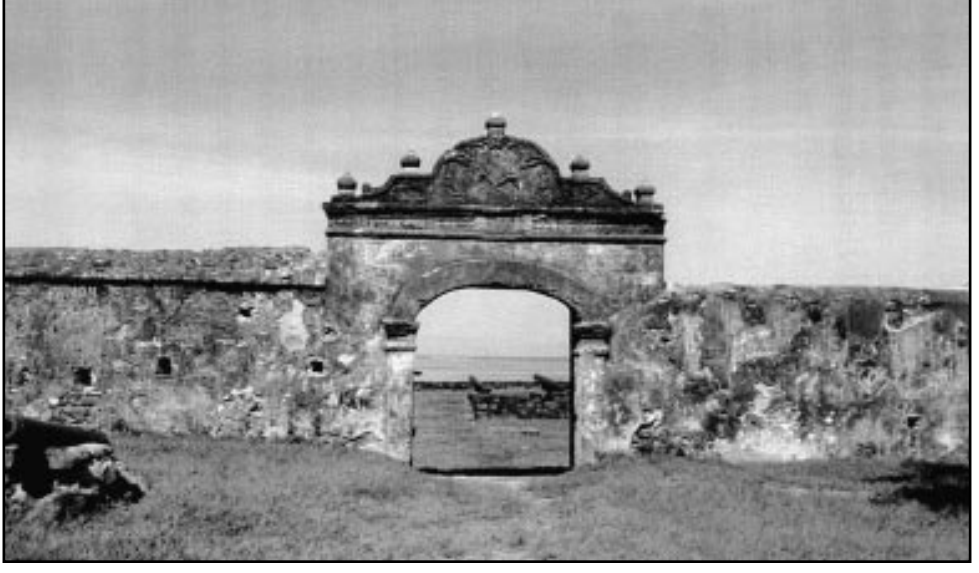
Puerta Principal of Fort Sta. Bárbara in Trujillo, Honduras.