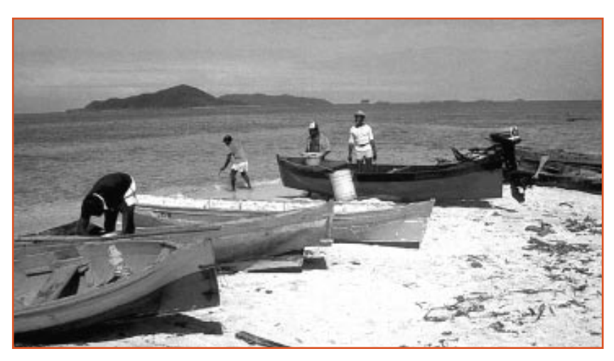
Northern Caribbean Coast of Honduras

Special Offer: Register before May 1st and you will be guaranteed a homestay with air-conditioning at no extra charge.